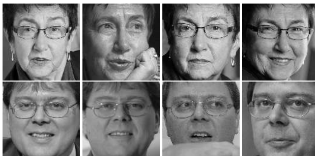
Fig. 2: Example images of two individuals from the Cropped images partition.