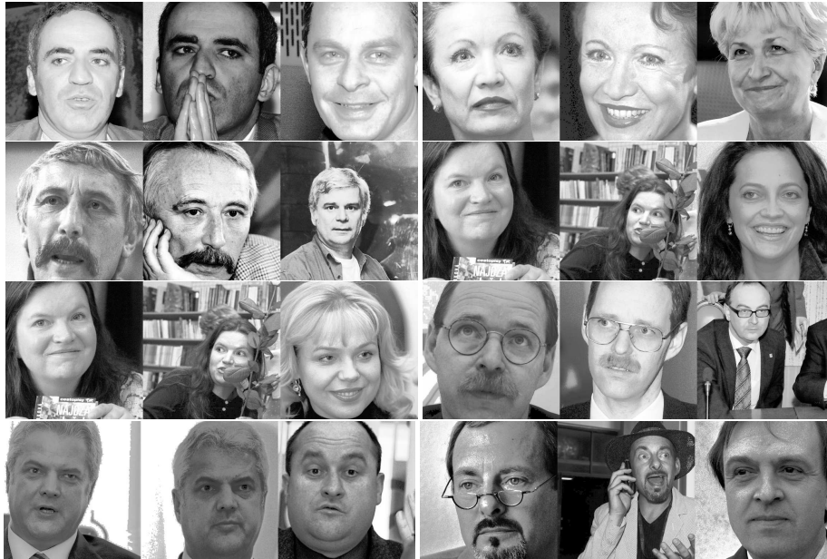
Fig. 6: Examples of the incorrectly recognized face images from the Large images partition using LBPHS, LDPHS, POEMHS and FS-LBP methods (from top to bottom). Each triplet contains a probe image, corresponding gallery image, incorrectly recognized image (from left to right).