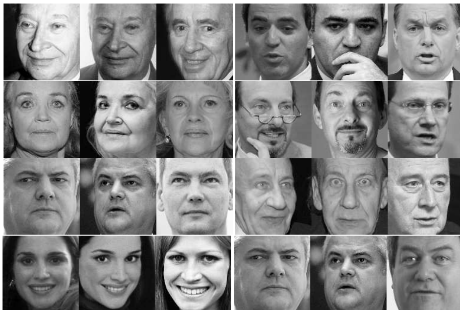
Fig. 5: Examples of the incorrectly recognized face images from the Cropped images partition using LBPHS, LDPHS, POEMHS and FS-LBP methods (from top to bottom). Each triplet contains a probe image, corresponding gallery image, incorrectly recognized image (from left to right).

rotated and aligned according to the eyes. All resulting images were resized to the size 128 \times 128 pixels. For the face recognition itself, we use the same configuration of the baseline methods as in the Cropped images case (see Section 4.2).