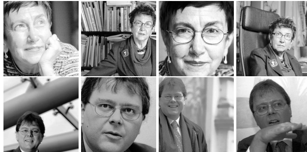
Fig. 4: Example images of two individuals from the Large images partition.